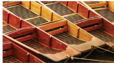
Punting is one of the greatest pastimes in Cambridge.